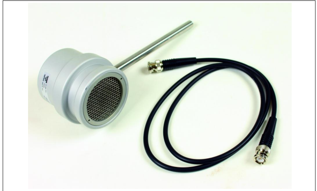
Fig. 1: Geiger-Muller counter tube, 45 mm 09007-01